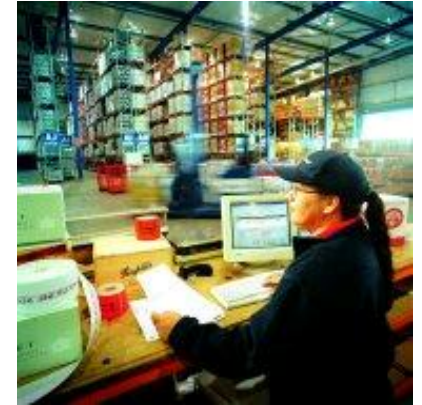
Supply Chain (hardware & software)