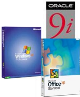
COTS Software Operating Software (apps, networking, GOTS)