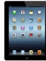
Mobile Devices (smart phones, tablets)