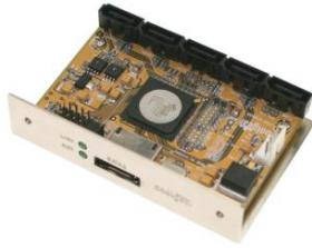
IT Equipment (Storage, comm, processing)