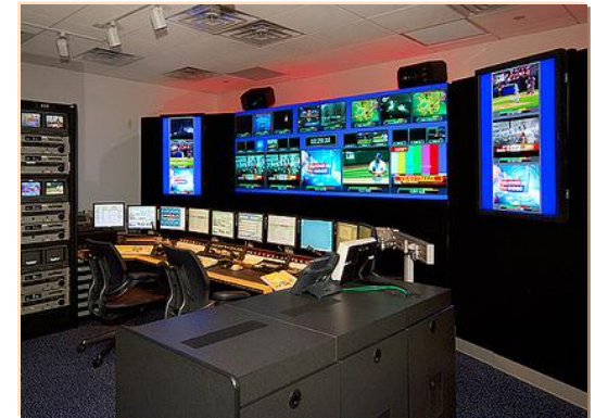
Industrial Control Systems (SCADA, HVAC, Power, etc.)