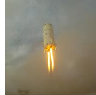
2011 Flight Demo